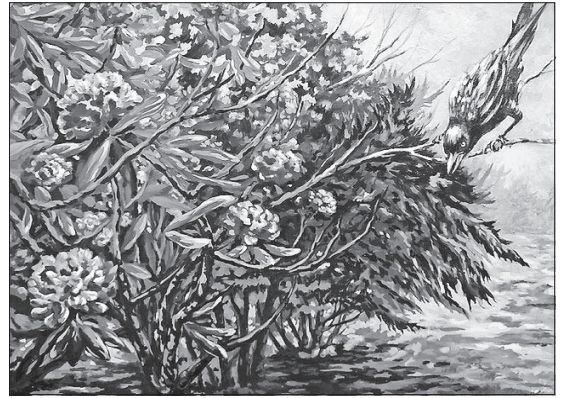
artist reception will be Jan. 25 from 6 to 7 p.m.