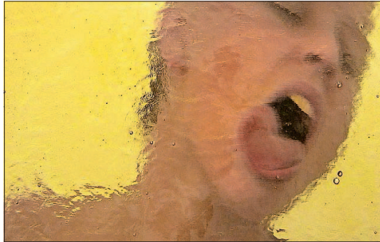
"Lick" by Elizabeth Willing (video still) will be on display at the CVPA Campus Gallery.

And there certainly are some interesting shows about town right now, notably the reconsidered landscape exhibition "Scapes: Placemaking