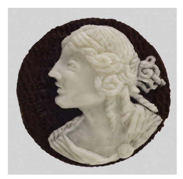
Judith Klausner, 'Oreo Cameo #9' 2011 Oreo sandwich cookie, 5.8 x 5.8cm

Daily performance of 'Gifting' by Matina Bourmas, 2:30-3pm