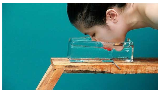
Kawita Vatanajyankur The Ice Shaver 2013 HD video - 2:46mins edition of 3 + 2AP