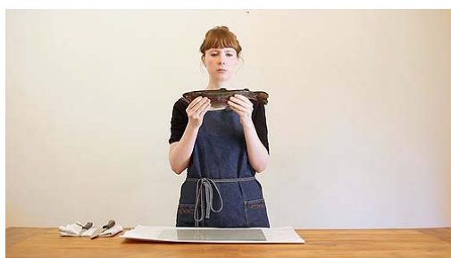
Nina Ross Untitled #1 (Fish) 2011 HD video - 3:29mins edition of 5