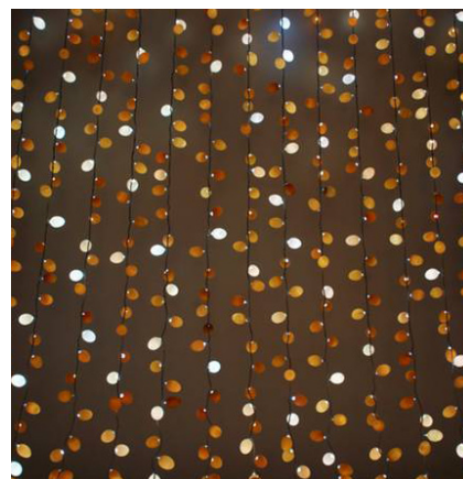
Sue Saxon + Jane Becker, 'All that is solid melts into air' (detail) 2012, eggshells on light strands, 600 x 200cm variable, Installation view, TarraWarra Museum of Art

This exhibition will consider the representation of food within the visual arts and beyond the standard still life tableaux.